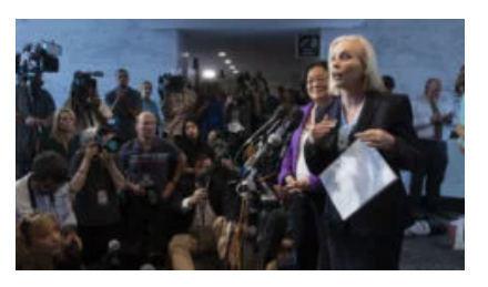
awver: Kavanaugh accuser may testify with right condit